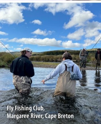
Fly Fishing Club, Margaree River, Cape Breton