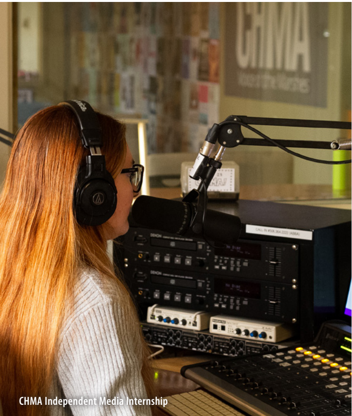
CHMA Independent Media Internship