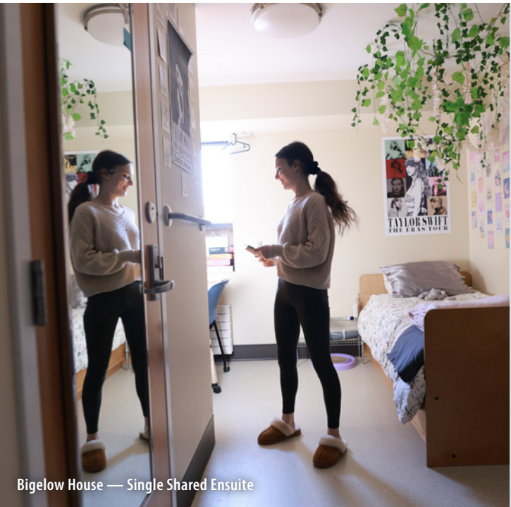
Bigelow House — Single Shared Ensuite