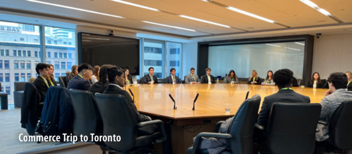
Commerce Trip to Toronto