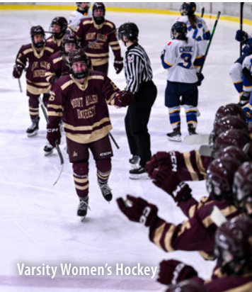
Varsity Women's Hockey