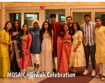
MOSAIC - Diwali Celebration