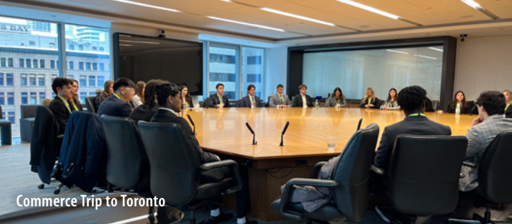
Commerce Trip to Toronto