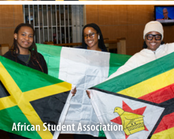
African Student Association