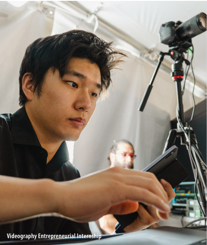
Videography Entrepreneurial Internship