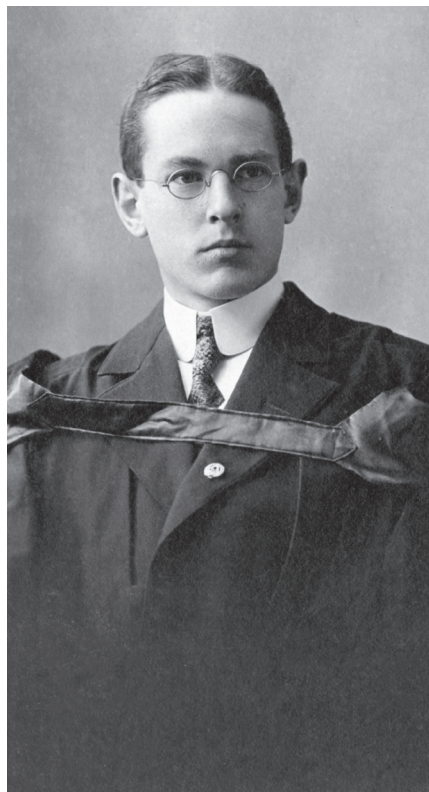
Mount Allison University Archives