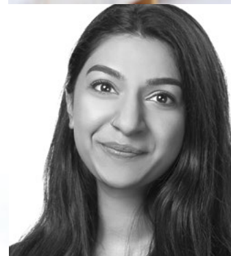
CLASS OF 2016

EVEN IF YOU DON'T KNOW WHERE THAT IS YET