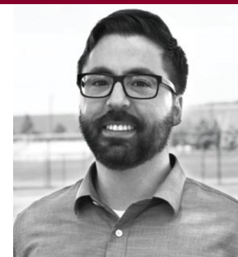
CLASS OF 2012