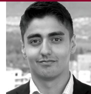
CLASS OF 2013