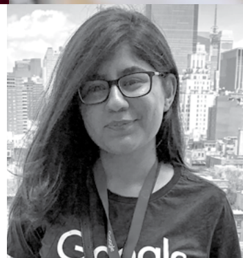
CLASS OF 2021